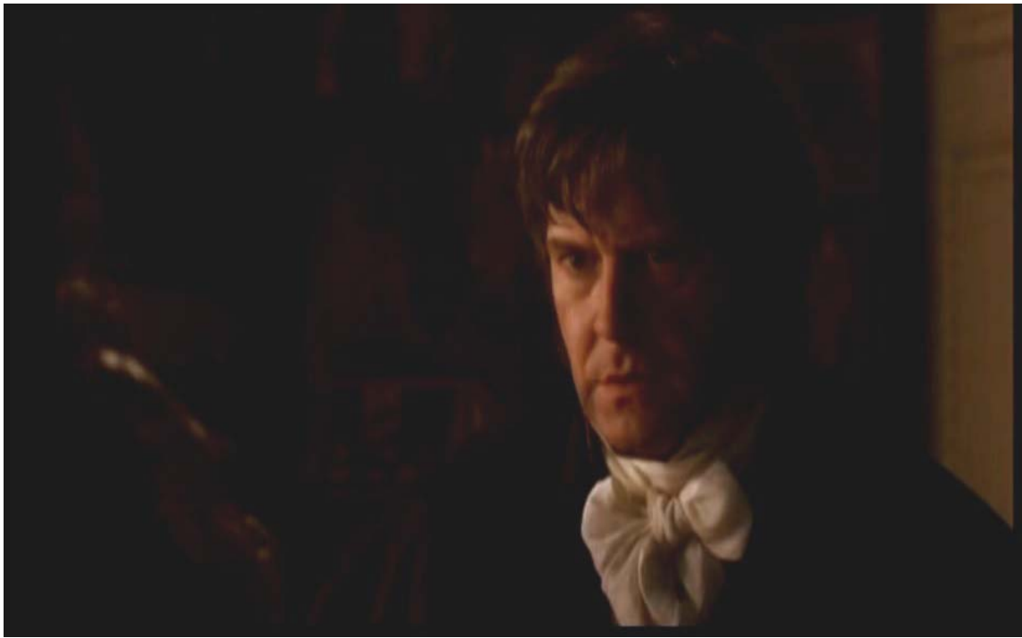
A. Lee – Sense and Sensibility (1995)

As seen before, the three opening chapters of Sense and Sensibility offer the orientation the readers need to find their way in the narrative: some of that orientation, however, is value-laden. Thus, readers are told that Mr and Mrs John Dashwood are mean-spirited before they get a chance to see or hear their actual words. In Ang Lee's film, much of this evaluative work is done by visual rather than linguistic means, or by visual and linguistic means combined. The second scene, in which Mrs John Dashwood talks her husband into giving nothing to their needy relatives, is a visual confirmation that the body language and facial signals exhibited by John Dashwood in his final interview with his father are not to be taken as symptoms of a generous disposition. His wife, in fact, is only slightly more upright and expressionless than he is, her voice as cold as her demeanour. Her first words, heard before her figure is seen, while the camera is shooting a street in a wealthy neighbourhood, provide a cohesive connection to the previous scene ("Help them? What do you mean, help