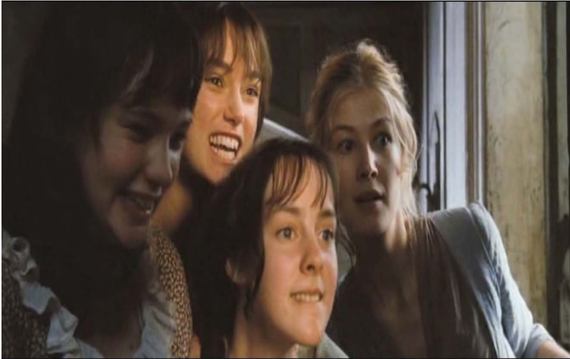
J. Wright – Pride and Prejudice (2005)

Linguistically, the inevitable condensation needed to turn a novel into a two-hour movie leads the filmmakers to make some interesting choices. One is the extreme compression of the exchange between Mr and Mrs Bennet, which is reduced from a few pages to a few lines – some of which arguably serve the purpose of delineating the different dispositions of the spouses: