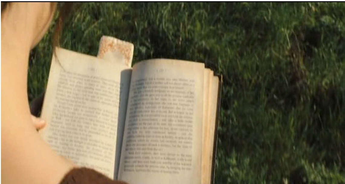
J. Wright – Pride and Prejudice (2005)

to share her field of vision (this is roughly the same result that is obtained in literary fiction through the use of a reflector – a technique Austen knew well). 26 However, with a double-perspective effect, which would not be possible or advisable in fiction, the viewer sees not only what Elizabeth sees, but also her slender neck and rebellious wisps of hair – more distinctive traits of a romantic heroine. Elizabeth's long, delicate fingers close the book and stroke its back cover, as if to visually underline, once again, her love for books.